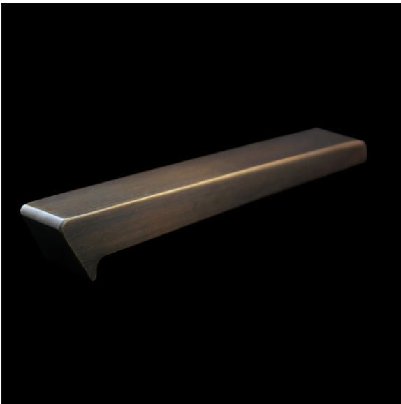
(shown in Silicon Bronze)

Description: This cast part is designed for walls from 0" - 3/8" radius edge. Childress is most commonly used on granite, marble, stone, block, brick, or other surfaces with a hard corner. This part uses two concealed SMART PINS PLUS anchors.