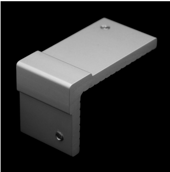
(shown in Clear Anodize)

Description: This patented part is designed for 90 degree walls with 1/8" radius edge. Model FA90A is most commonly used on granite, marble, stone, block, brick, or other surfaces with a hard corner and no vertical clearance restrictions. This part uses two SMART PINS PLUS anchors.