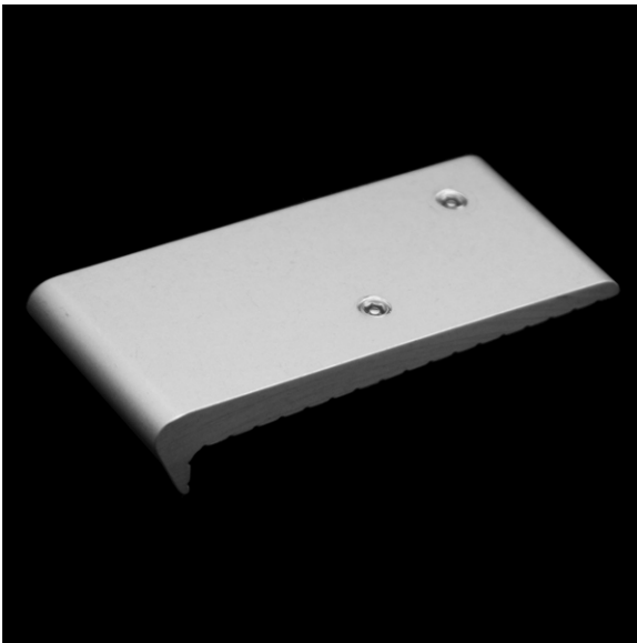
(shown in Clear Anodize)

Description: This part is designed for walls with 1/8" radius edge (may be used in place of model FA 90). FR0.12 is most commonly used on granite, marble, stone, block, brick, or other surfaces with a hard corner. This part uses two SMART PINS PLUS anchors.