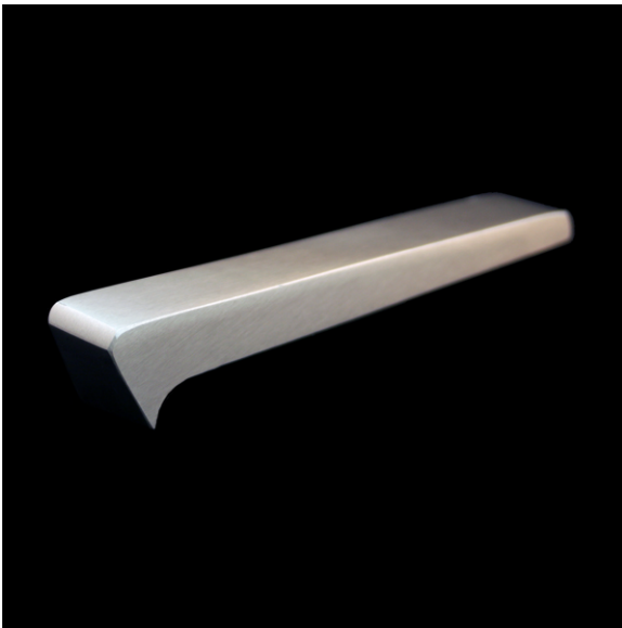
(shown in White Tombasil)

Description: This cast part is designed for walls with 1/2" radius edge. Morgan is most commonly used on concrete. This part uses two concealed SMART PINS PLUS anchors.