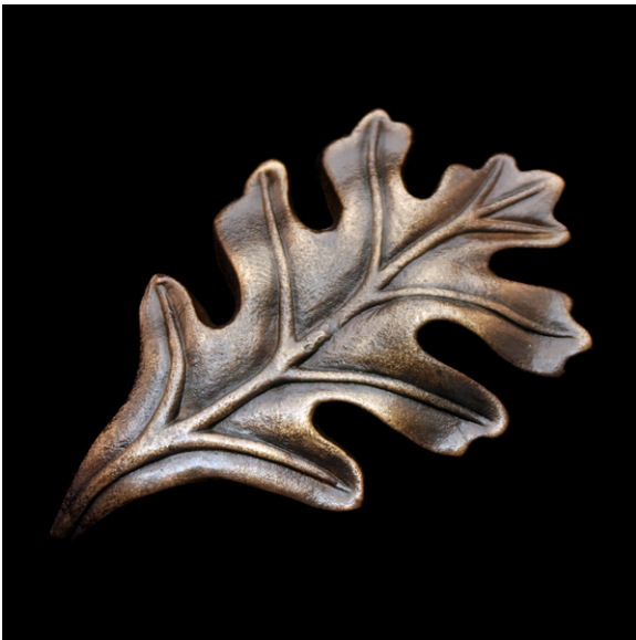
(shown in Cast Silicon Bronze)

Description: The White Oak family consists of 6 different white oak leaves rendered at realistic scale and incredible detail. The parts use two concealed SMART PINS PLUS anchors.