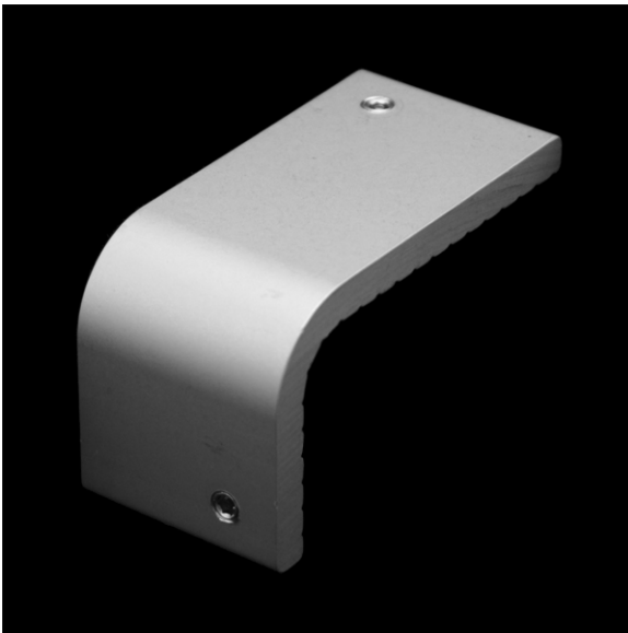
(shown in Clear Anodize)

This product is not intended for use on steps, stairs, sidewalk curb, or any pedestrian trafficked surfaces.