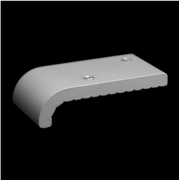
shown in Clear Anodize

This product is not intended for use on steps, stairs, sidewalk curb, or any pedestrian trafficked services.