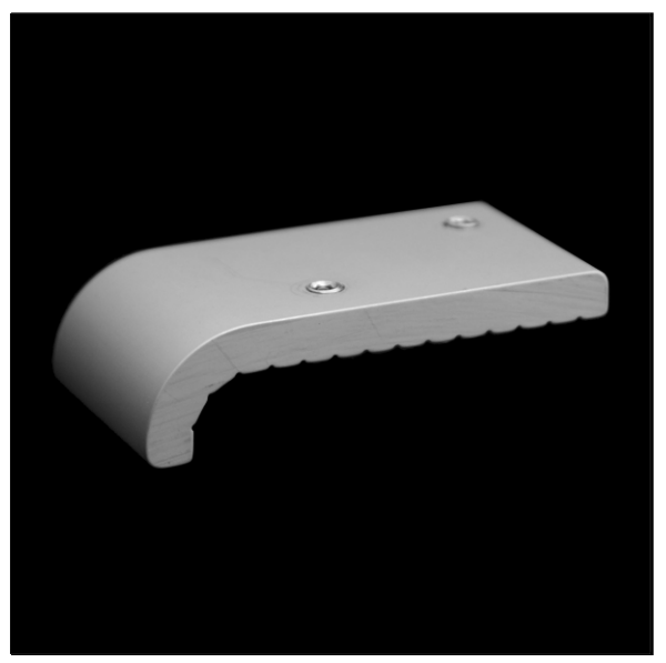
shown in Clear Anodize

This product is not intended for use on steps, stairs, sidewalk curb, or any pedestrian trafficked surfaces.